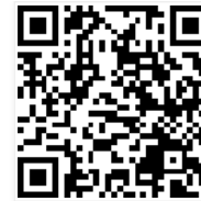
Scan this QR code to Donate

The War of Independence did not ultimately create a complete and utter separation from Britain, nor was it a complete separation from the Papacy in the form of the Holy Roman Empire, but it did secure American land and soil for Americans, it did make our law paramount on the land and soil, and it did secure our air and coastal waters.