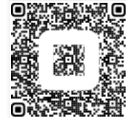
Scan this QR code to Donate